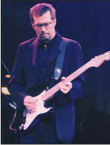
In 1988, Eric Clapton became the first artist to have a Fender Signature model.

raise money for his drug rehabilitation center, Crossroads. Another famous Clapton guitar, the psychedelic-painted 1961 Gibson SG/Les Paul used in Cream, is now in the collection of artist/producer Todd Rundgren.