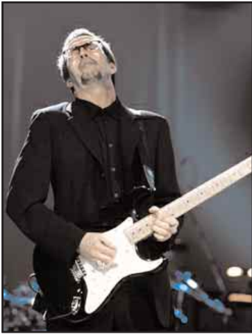
Clapton began his stint with the Yardbirds playing Fenders.