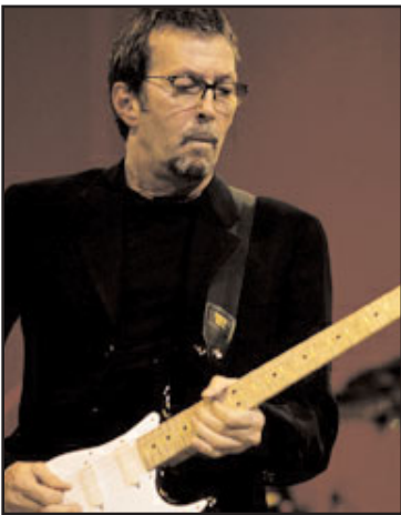
He has been inducted three times into the Rock & Roll Hall of Fame, for the Yardbirds in 1992, Cream in 1993 and as a solo artist in 2000.

Delaney & Bonnie & Friends, and got to know the musicians who would later form the core of Derek and the Dominoes. He also appeared live with John Lennon's Plastic Ono Band , which resulted in the album Live Peace in Toronto .