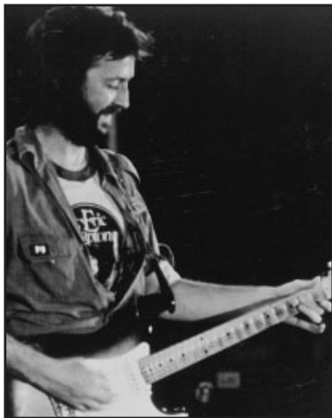
In his early, formative years as a guitar player, he was influenced by Muddy Waters' "Best of Muddy Waters album."